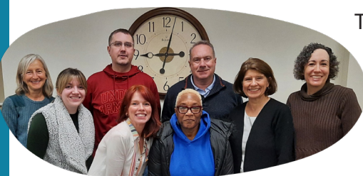
Glenwood United Methodist Neighboring community and EUMA staff.

This Bridge of Hope @ EUMA partnership establishes or restores the positive relationships that so many of us take for granted. Mobilizing the power of the Body of Christ is what our Bridge of Hope @ EUMA ministry is designed to do.