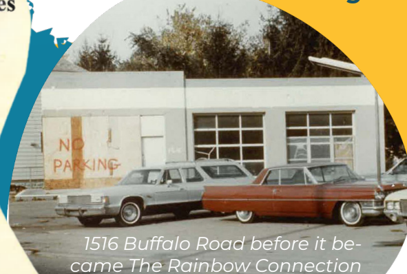
1516 Buffalo Road before it became The Rainbow Connection

To learn more about The Rainbow Connection, visit EUMA-Erie.org .